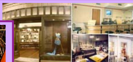
Levine Museum of the New South