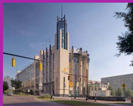
Johnson & Wales University