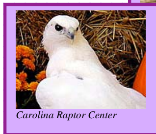
Carolina Raptor Center

time, the following guest organizations of the JWU Library and the Arts & Science Council were treated to lunch and a hint of what is to come from Johnson & Wales University: